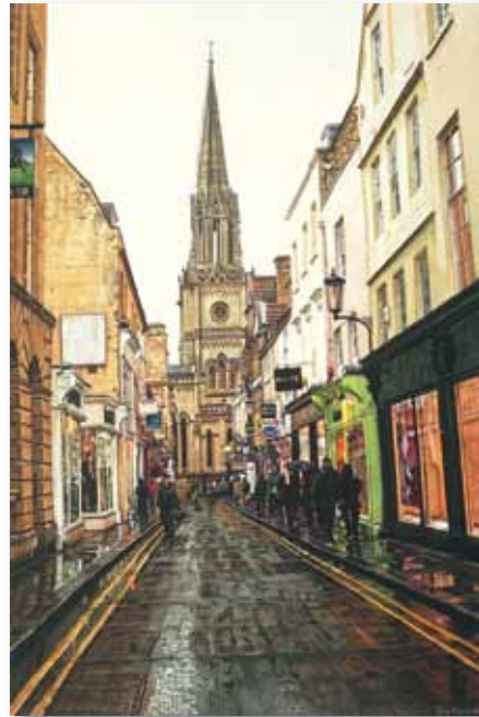
Green Street"18" x 12" edition of 250,