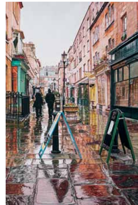
"Margarets buildings Looking North" 18" x 12" edition of 250,