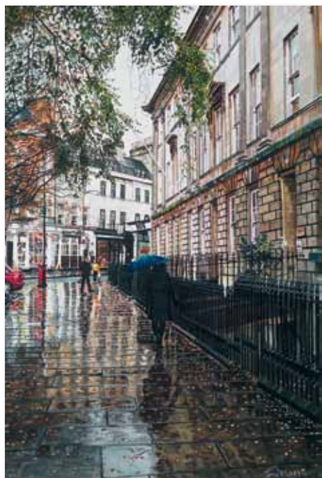
"Laura Place I", 18" x 12" edition of 250,