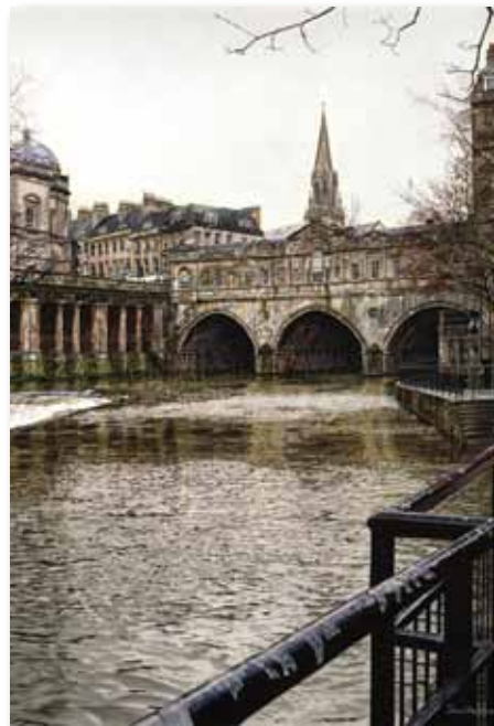
Pulteney Bridge"18" x 12" edition of 250,