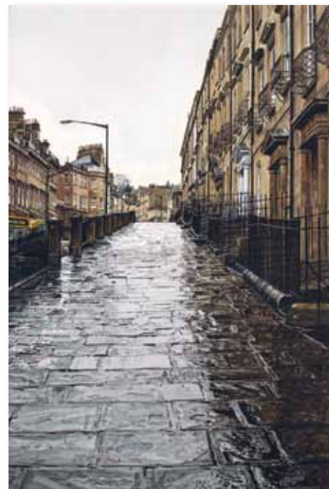
"Landsdown Road", 18" x 12" edition of 250,