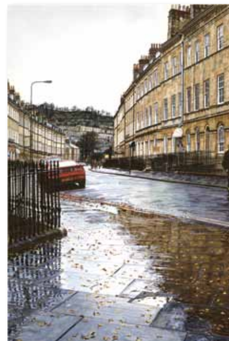
"Henrietta Street" 18" x 12" edition of 250,