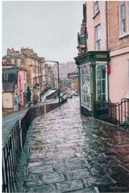
Belvedere"18" x 12" edition of 250,