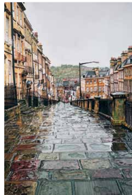
"Belmont", 18" x 12" edition of 250,