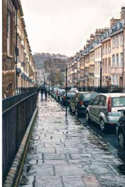
Gay Street"18" x 12" edition of 250,