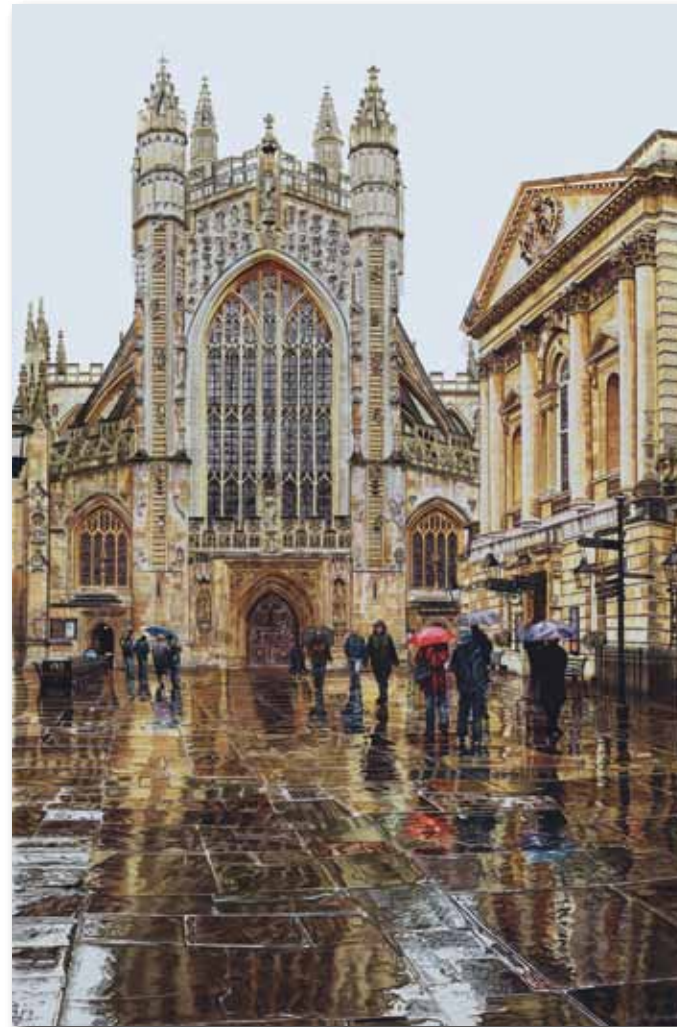
"Bath Abbey - A Rainy Afternoon", 30" x 18" enhanced edition of 50 and 18" x 12" edition of 250