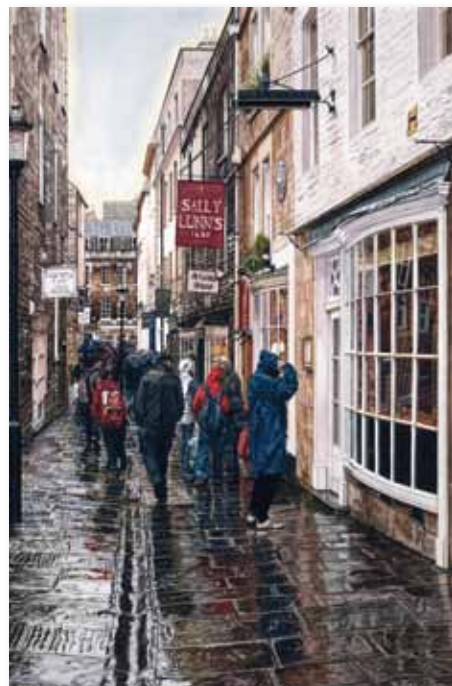
"Sally Lunn's Tea Shop", 18" x 12" edition of 250,