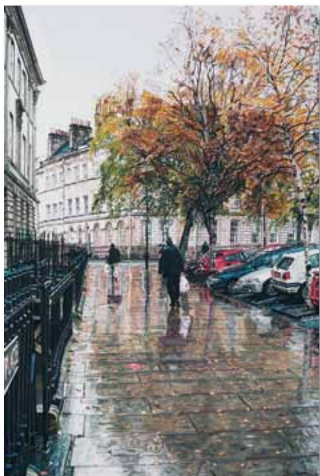
"Laura Place II", 18" x 12" edition of 250,

6 Bridge Street, Bath BA2 4AS Telephone 01225 312773 e-mail: info@hawkinsfineart.com www.hawkinsfineart.com