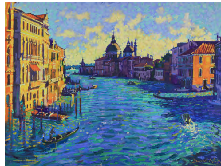
'The Grand Canal, Venice', oil on board 55cm x 70cm