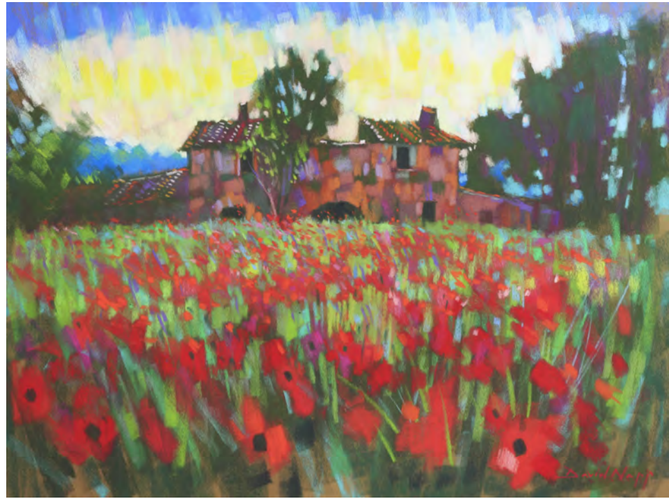
'Old Ruin and Poppy Field, Cesi', pastel 60cm x 80cm