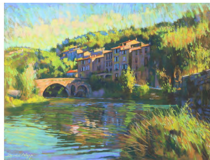
'Sauve, Le Gard', pastel 60cm x 80cm