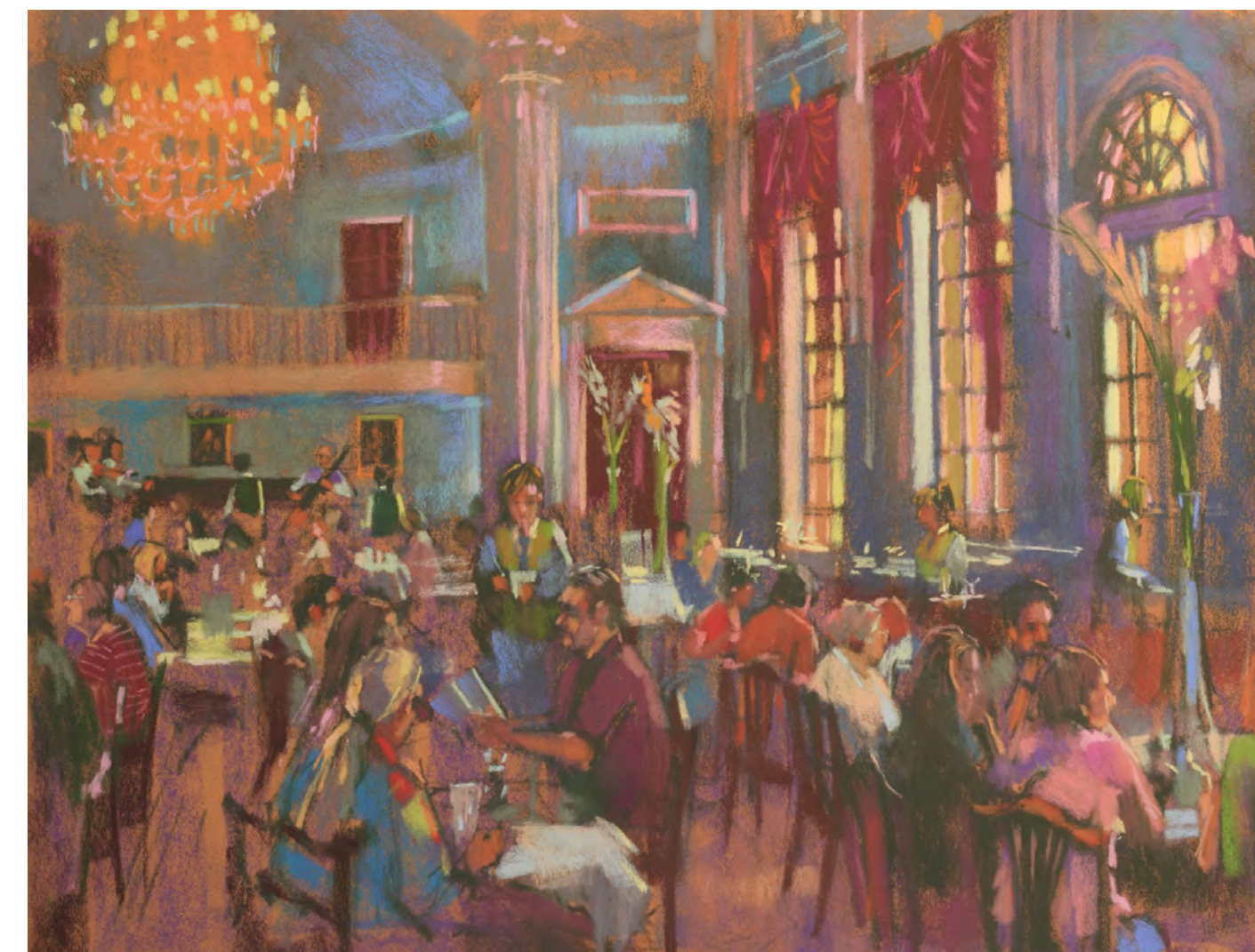
'The Pump Room - Bath', pastel 50cm x 65cm