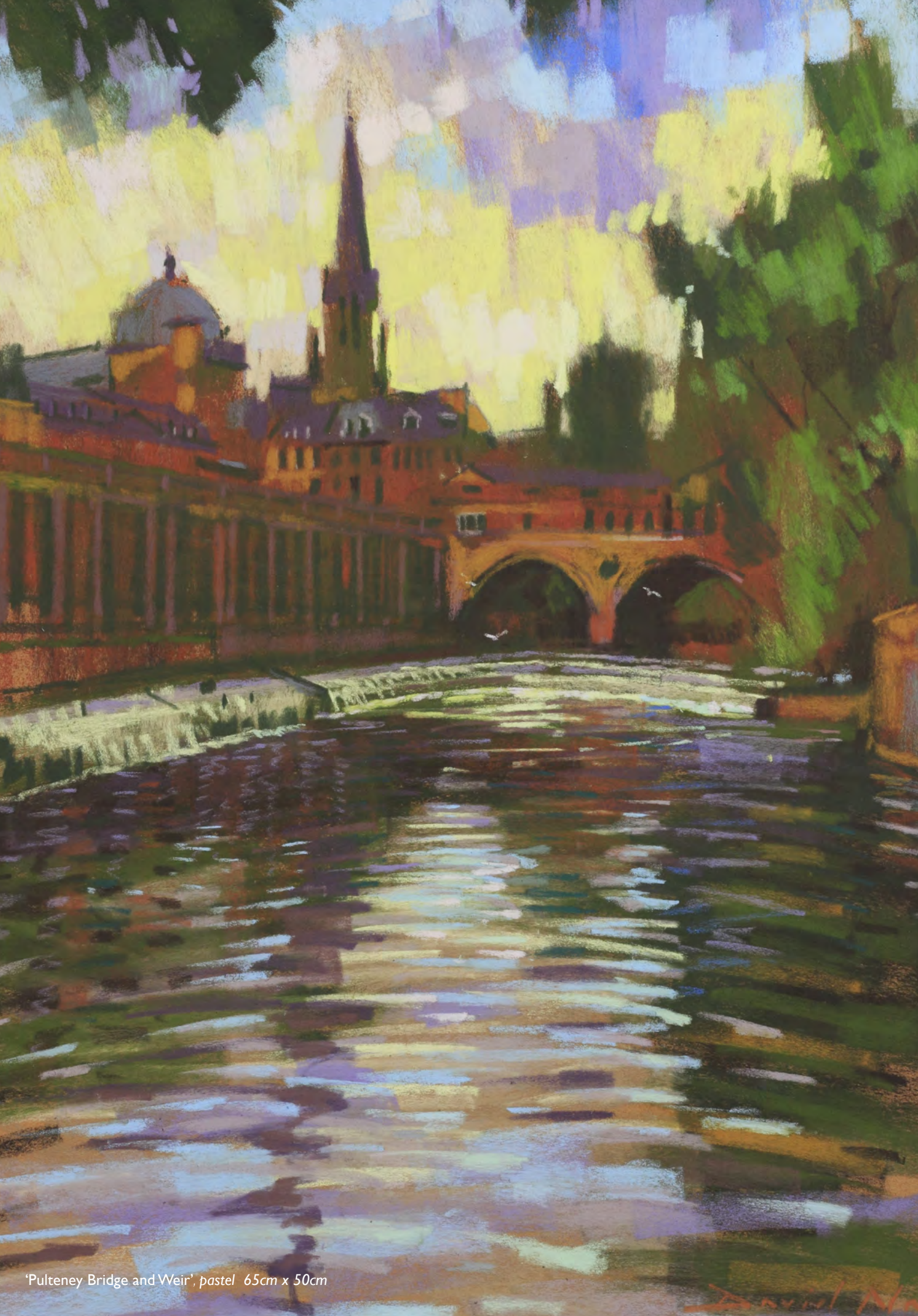
'Pulteney Bridge and Weir', pastel 65cm x 50cm