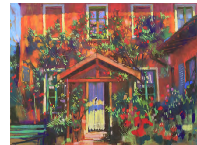
'Fattoria Roccolo, Lombardy', pastel 58cm x 80cm