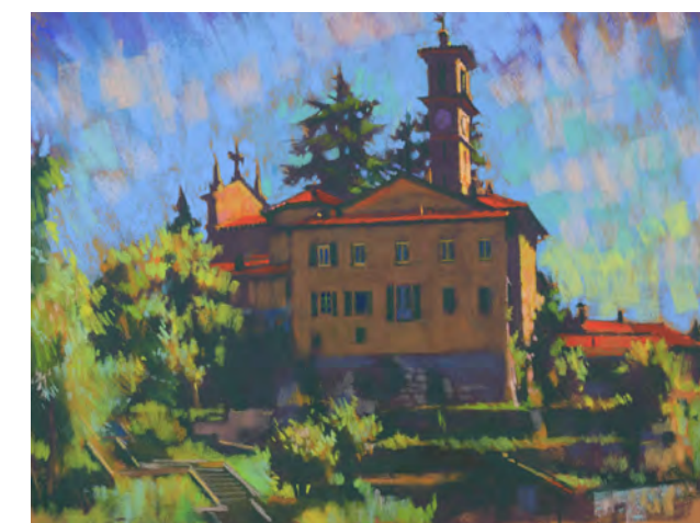
'Old Church, Brinzio', pastel 50cm x 65cm