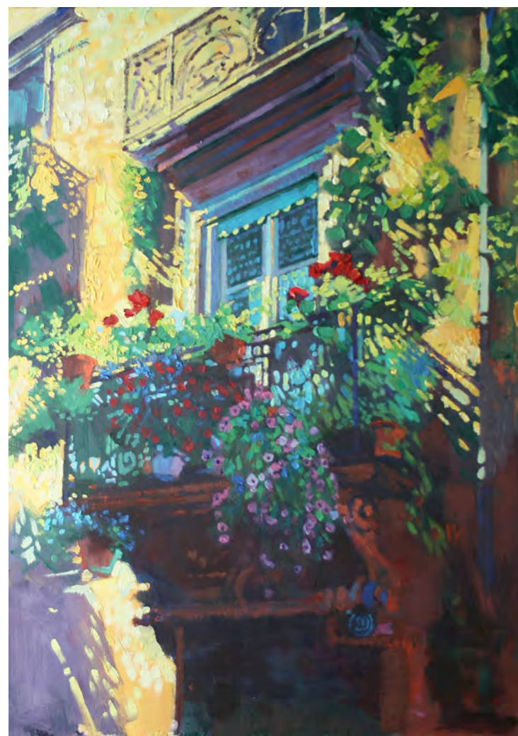
'Le Balcon', oil on canvas 70cm x 55cm