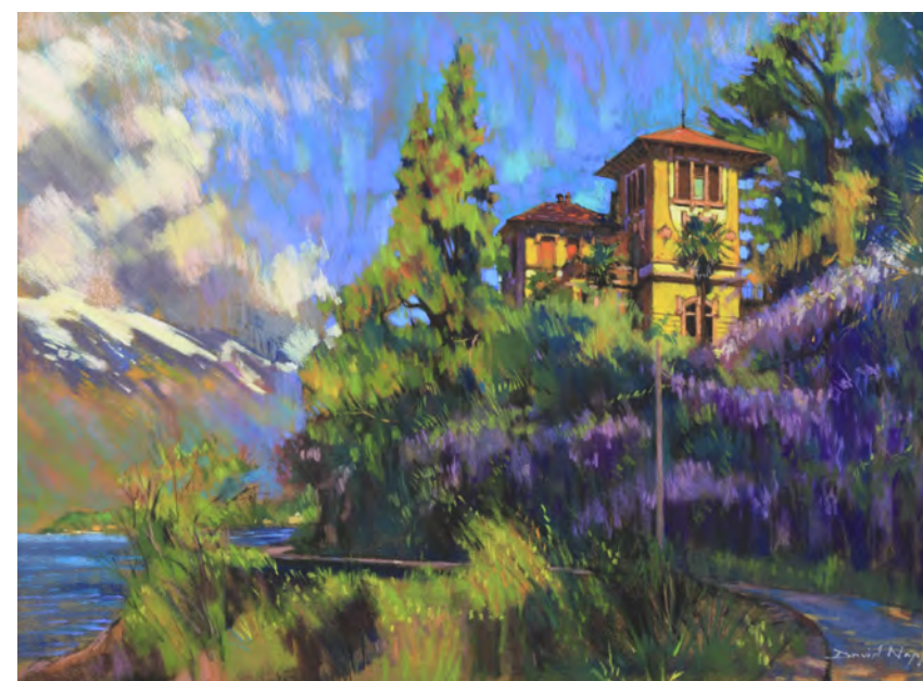
'Villa and Wisteria, Lake Maggiore', pastel 60cm x 70cm