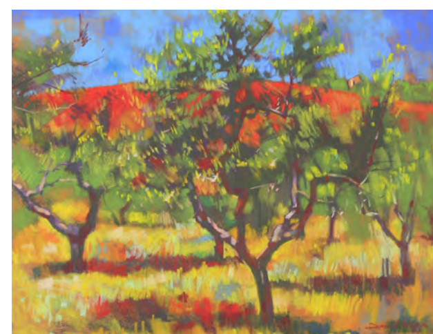
'Olive Grove and Poppy Field', pastel 50cm x 65cm