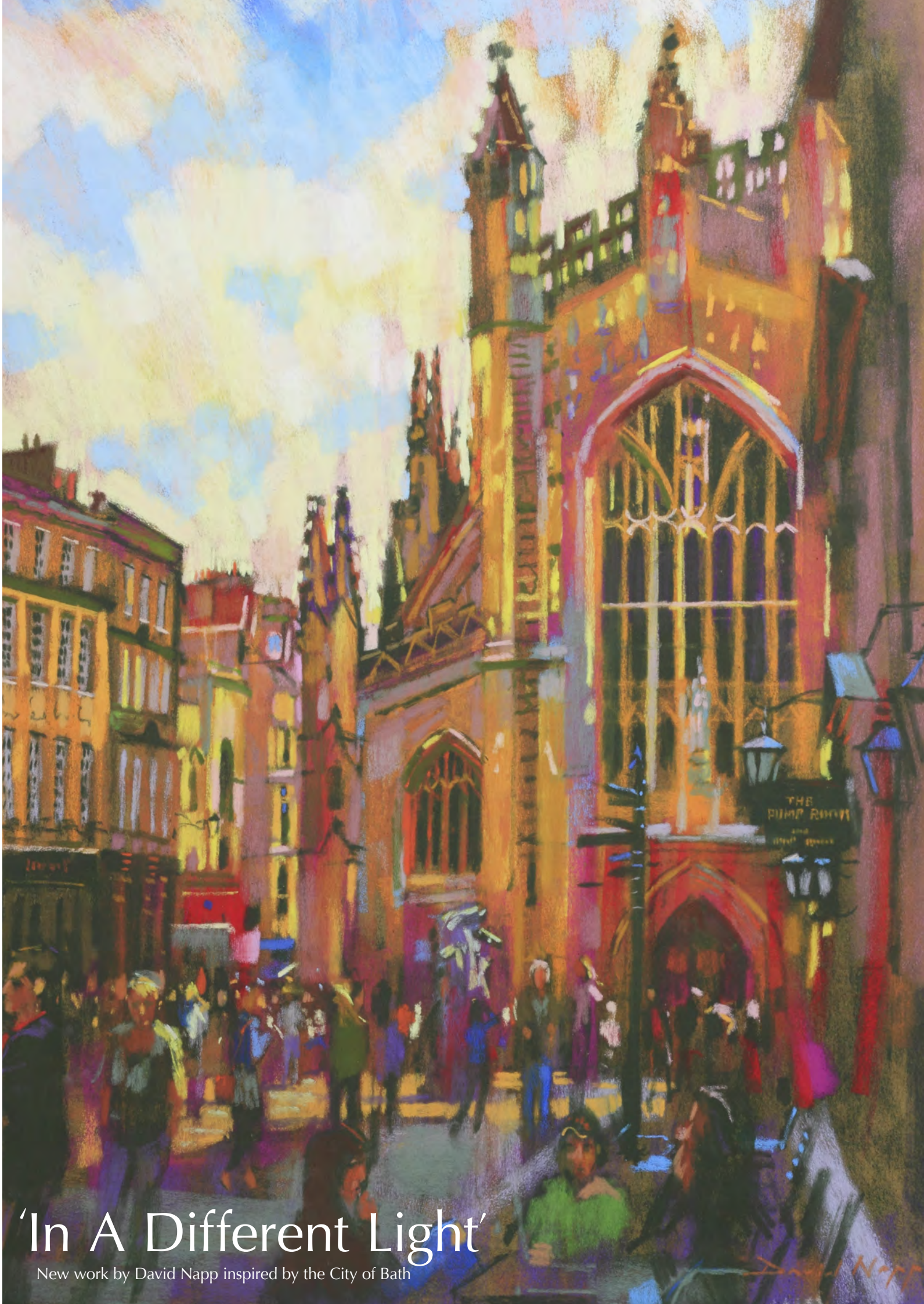
Front: 'Bath Abbey', pastel 80cm x 60cm

'In A Different Light' New work by David Napp inspired by the City of Bath