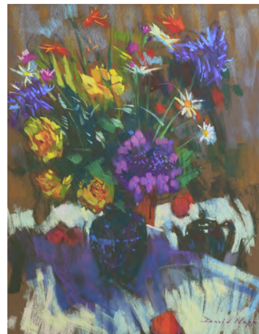
'Still Life', pastel 65cm x 50cm