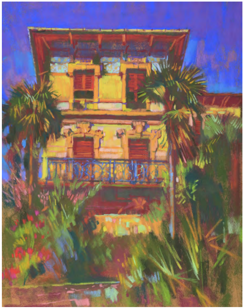
'Villa Borghese and Palms, Lake Maggiore', pastel 65cm x 50cm