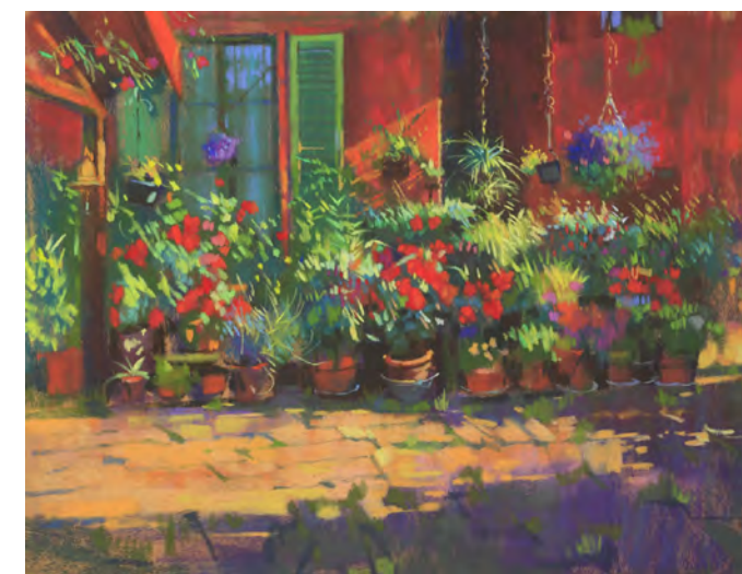
'Potted Plants at sunset, Lombardy', pastel 50cm x 65cm