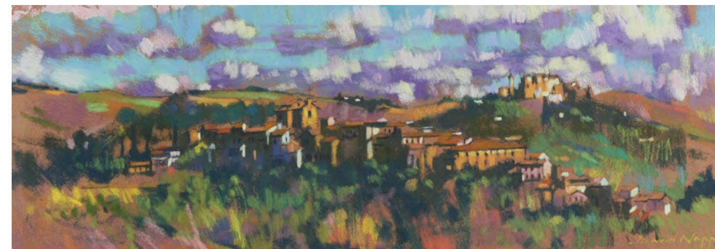
'Castiglione: Morning Light', pastel 61cm x 23cm