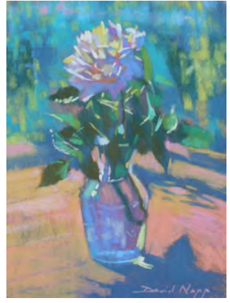
'The Rose', pastel 32cm x 25cm