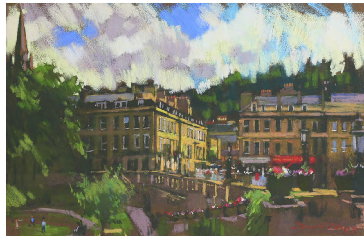
'Parade Gardens - Bath' pastel 32cm x 50cm