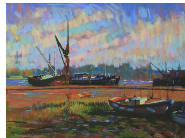
'Pin Mill, Suffolk', pastel 50cm x 65cm